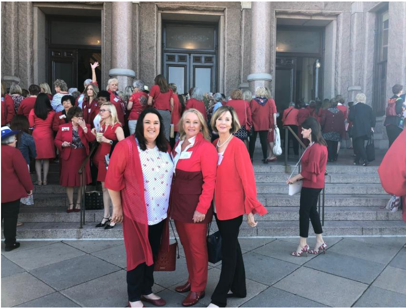
Parker County Ladies Representing